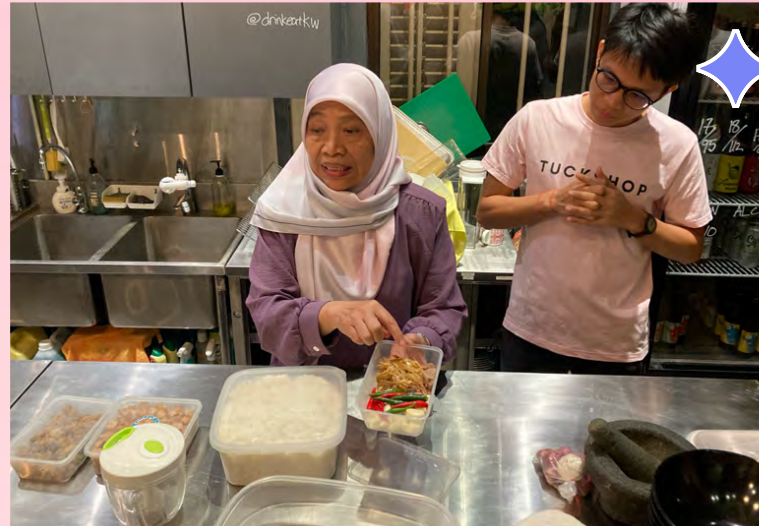
RESEARCH AND EXPERIMENTATION IN CRAFT